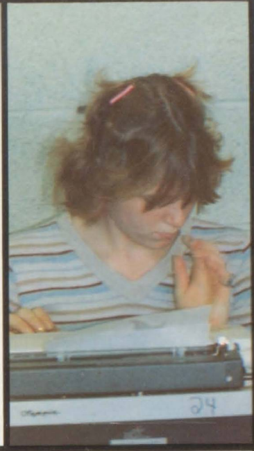
SOPHOMORES — pg. 38