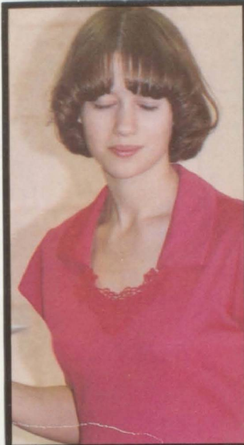
SENIORS — pg. 23