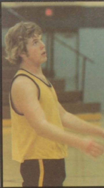
JUNIORS — pg. 35