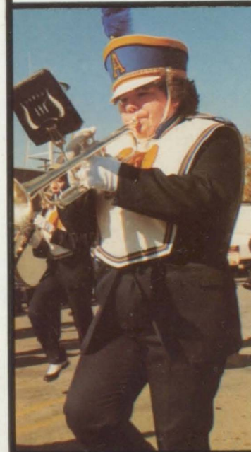
ORGANIZATIONS — pg. 54